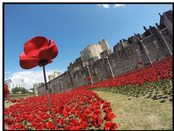
An Amazing Poppy display by the British at the London Tower Bridge

The summer of 2014, the moat has been filled with 888,246 red ceramic poppies, one for