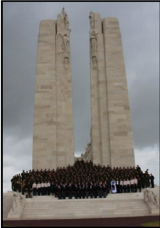
2009 Pilgrimage Group and Canadian Forces Nijmegen Marchers at the Vimy Memorial

History of the Nijmegen March – The first Four Days March took place in 1909. Participants could start from fifteen different places in the Netherlands. They had to walk 140 km in four days, 35 km per day. The March was organised by the Dutch League for Physical Education. On March 1 st , there were only 306 male participants, ten of whom were civilians.